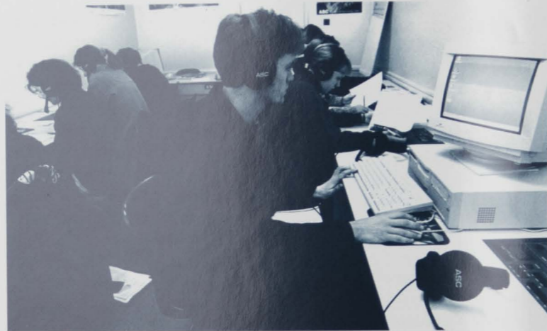
NCIR's newly opened state-of-the-art language laboratory.

As part of its ongoing development programme and enhancement of facilities, a new state-of-the-art language laboratory was opened on campus in Ranelagh at the beginning of the 1996/97 academic year. This laboratory contains audio stations and multi-media points and is now operational for language classes. In addition to the normal student usage, a new evening programme of Italian and Spanish classes is currently being delivered in the laboratory. The laboratory is accessible to all NCIR students, studying on and off-campus but will be of particularly beneficial to students of the B.A. in European Business Studies and Languages, of which there are now over one hundred.