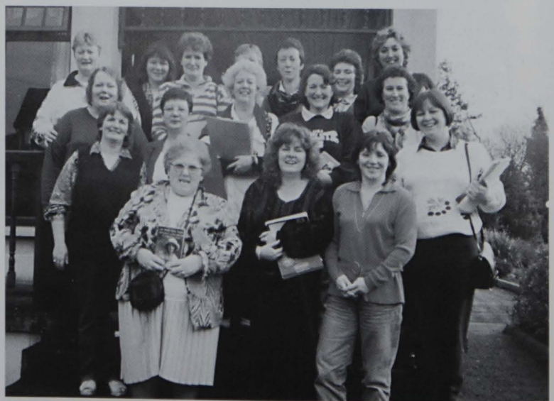
Pictured above are participants on the NCIR Access Certificate in Women's Studies and Social Development course, which is being delivered in partnership with Aontas.