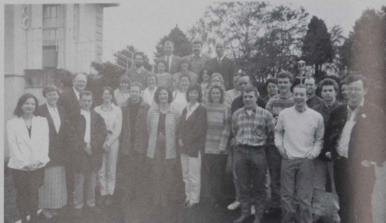
Pictured above are the Class Representatives who attended the Off-Campus Class Representatives meeting held in NCIR in November. Representatives of NCIR classes from over twenty-five locations attended.