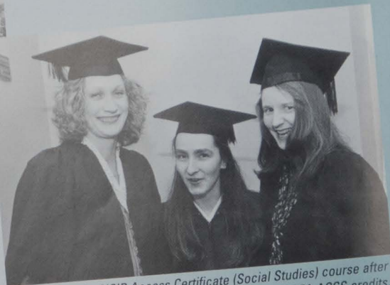
Graduates of the NCIR Access Certificate (Social Studies) course after being conferred with their NCIR Certificates and NCEA ACCS credits.