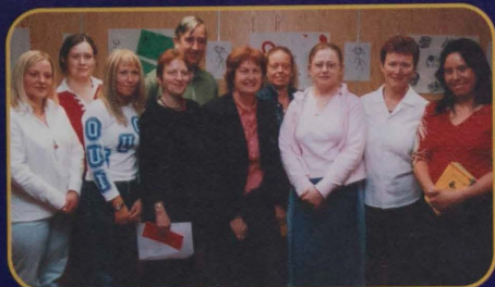
Above: NCI's Parents in Education Programme participants