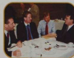
Above: Delegates enjoying the Masterclass