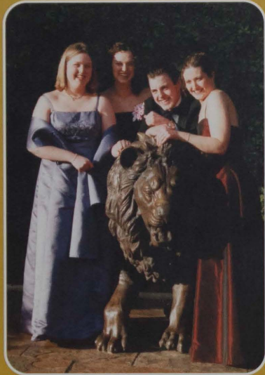
Students enjoying the ball at Clontarf Castle

National College of Ireland Clubs & Societies Awards 2002 were held in Clontarf Castle in Dublin. The event recognised the achievements of NCI's clubs and societies and also the contributions of particular students involved in the organisation and running of the clubs and societies. Over 150 staff and students attended the event.