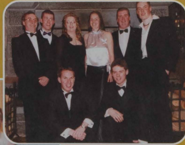
NCI Society Event of the Year - Socrates - Trip to Galway

A total of 9 awards were presented, including Club of the Year, Society Individual of the Year, Fresher of the Year and Athlete of the Year. A special award, the President's Award, was given collectively to seven students – three NCI students who were selected to represent Ireland on the Irish Colleges Snooker team and the four students who represented Ireland and National College of Ireland on the Irish Colleges Hockey Team.