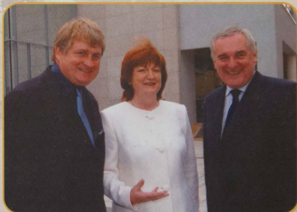
NCI Opening 2002