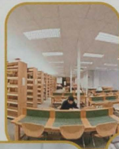
Library, Community Information and Meeting Room Facilities